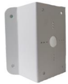
DS-1276ZJ-SUS Corner Mounting Bracket